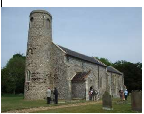
Dot Shreeve's drawing and RTCS at Beeston St Lawrence in 2010.

The church comprises a round west tower, nave and chancel of the same width though the chancel is a little lower, and a south porch. As the nave has been widened by the rebuilding of its south wall on an alignment south of the original wall, the tower is off-centre to the north and so the ridge of the nave roof meets the tower's curved east wall off-centre to the south. The roofs are tiled with blue glazed pantiles.