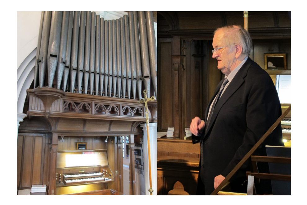
The organ at St Mary's