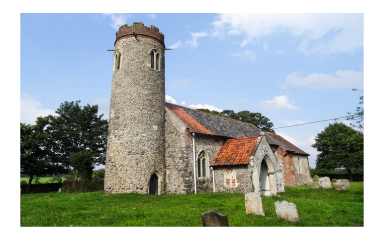
Sustead, Saints Peter and Paul

The only entrance to the tower of Sustead Saints Peter and Paul is by an exterior door to the south. As at Bessingham, iron bound conglomerate is used for the quoins at the west end of the nave. Between the nave and chancel is a fine 15<sup>th</sup> century red brick rood stair turret. Graffiti on the porch includes a left hand spanned with the thumb turning the corner of the stone (as if holding on to the stone). Armorial shields decorate the bowl of the 15<sup>th</sup> century font and the chancel has a double piscina. Fragments of medieval glass in the nave windows show musicians and a delightful St Catherine with her wheel.