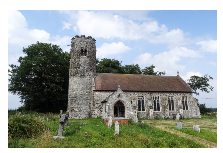
Bessingham, St Andrew

The only entrance to the tower of Sustead Saints Peter and Paul is by an exterior door to the south. As at Bessingham, iron bound conglomerate is used for the quoins at the west end of the nave. Between the nave and chancel is a fine 15<sup>th</sup> century red brick rood stair turret. Graffiti on the porch includes a left hand spanned with the thumb turning the corner of the stone (as if holding on to the stone). Armorial shields decorate the bowl of the 15<sup>th</sup> century font and the chancel has a double piscina. Fragments of medieval glass in the nave windows show musicians and a delightful St Catherine with her wheel.