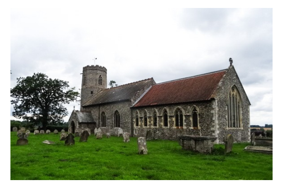
Wramplingham, Saints Peter and Paul

By the time we reached Wramplingham , Sts Peter and Paul, it was dull and overcast. Here the tower is circular to just above nave ridge roof height and has a contemporary octagonal top with Decorated belfry openings. There a six lancet windows with a continuous hood mould, linked by a string course, on either side of the chancel. Inside, the chancel windows are deeply splayed and have delicate shafts in between with hood moulds ending in decorative heads or leaf decoration. A polished wooden Memorial Plaque, has the names of seven parishioners who died in the Great War and one in World War 11.