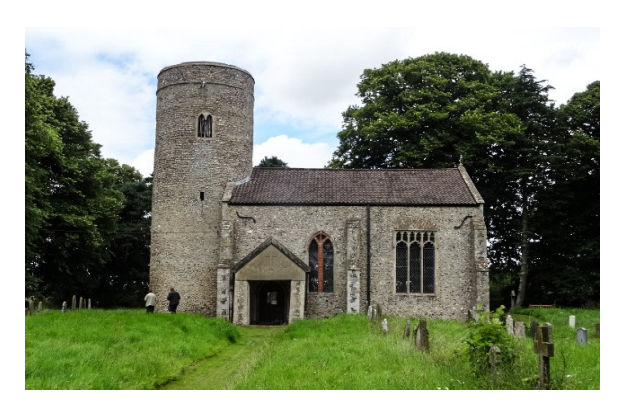
Runhall, All Saints

Runhall, All Saints, was the first stop on our July tour. Approached from the south up a sloping churchyard, the church has a rather square appearance. Here the chancel was burnt down in the 16<sup>th</sup> century and never rebuilt. The post Norman tower is circular to its full height of around 40 feet and was added to an earlier church. Beneath the south porch, the entrance door has some interesting ironwork. Inside even more ancient ironwork can be seen on the tower door; a dragon, serpents and horseshoe designs. In front of this door is a 14<sup>th</sup> century font, with tracery on bowl and shaft. Wall Memorials from the two World Wars, tell us that nine men from the village died in the Great War and four in the second conflict. The chancel burned down and has never been replaced.