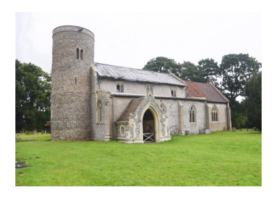
Merton.

Now church heritage group the Round Tower Churches Society has come forward to give £500 grant to get the fundraising under way.